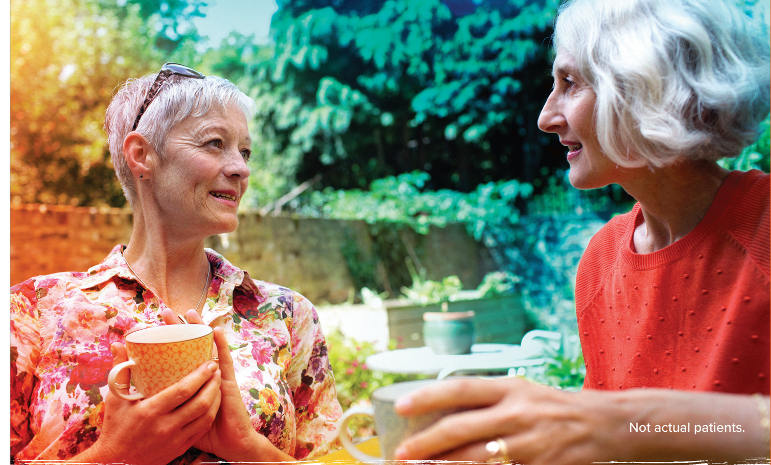
Not actual patients.

These are not all the possible side effects of MONJUVI. Your healthcare provider will give you medicines before each infusion to decrease your chance of infusion reactions. If you do not have any reactions, your healthcare provider may decide that you do not need these medicines with later infusions. Your healthcare provider may need to delay or completely stop treatment with MONJUVI if you have severe side effects.