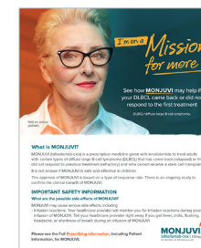
MONJUVI Patient Brochure

The following patient resources on MONJUVI.com may be useful as you assist someone who is receiving MONJUVI.