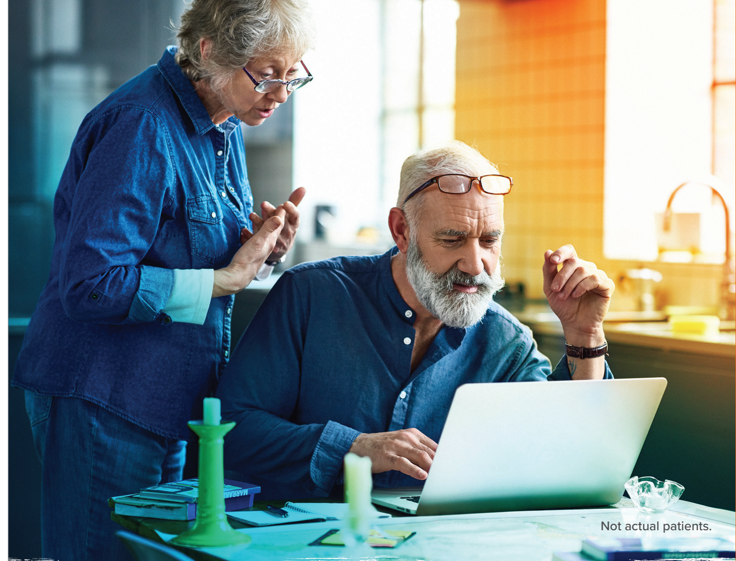
Not actual patients.

The person you're caring for has been given a Treatment Journal. This piece will help you both keep track of any infusion-related side effects that may occur. You can also make notes on emotional and physical well being, among other things.