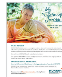
MONJUVI Treatment Journal